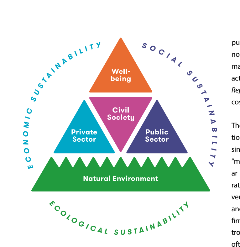
Figure 1. Sustainable well-being

Adopted from: Eeva Hellström, Sustainable Economy Forum